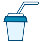
Eating or drinking